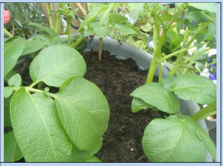
An inch or so, that's 2.3 cm, space left for watering.

If you are impatient and cannot wait to plant your Christmas treat, it's not too late. Well, certainly not down in beautiful, mild, Pembrokeshire