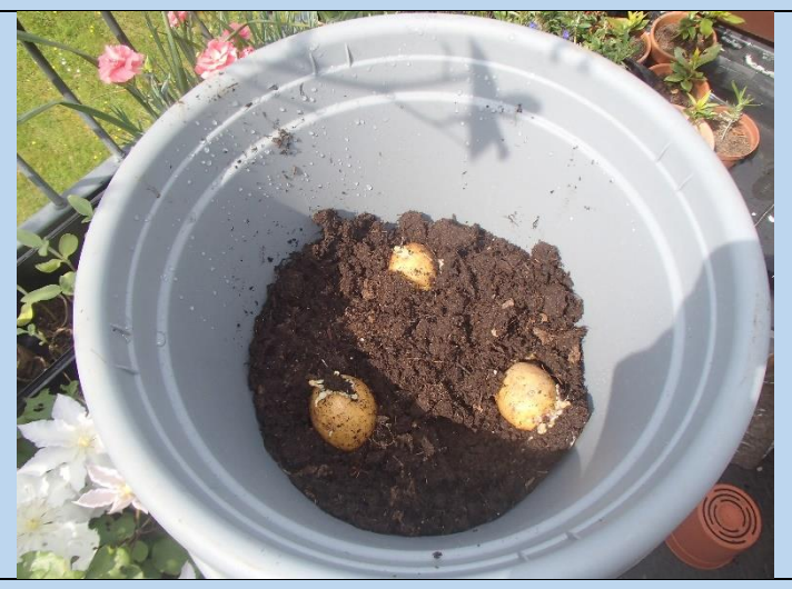
Three potatoes is about right for this sized pot for "New" potatoes. For Maincrop potatoes I only grow one tuber per pot.