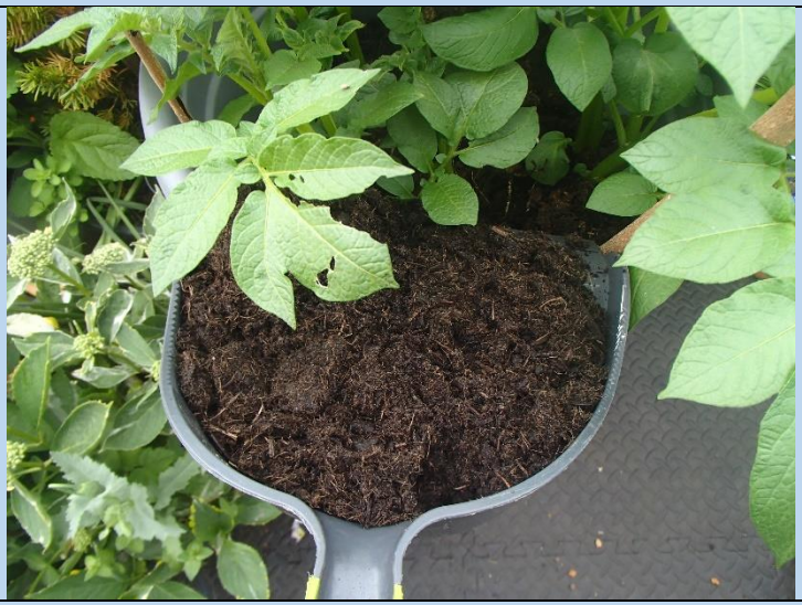
Earthing up with peat free compost